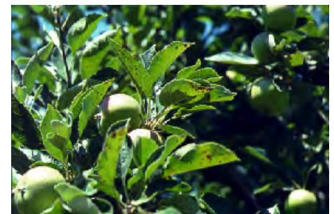
Figure 3: Using traditional summer sprays may result in a tendency for increased "scarf skin" in some varieties such as Jonathan.

Apple fruit tree oil sprays are used in controlling mites including European red mite, scale insects and some thrips and aphids. If the grower has not had a problem with these insects previously, one oil spray application at the tight cluster to pre-pink stage is recommended. If there is a known insect problem, two oil applications are necessary. Apply the first between bud burst and the half-inch green stage and the second with BIOPEST® or SUMMER® at the tight cluster to pre-pink stage.