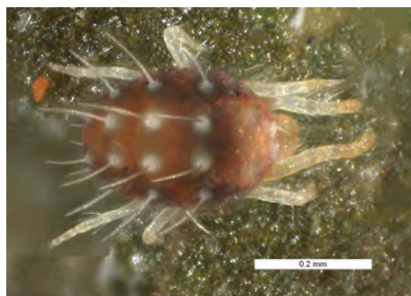
Figure 1: European red mite

damaging components (aromatics) without affecting its effectiveness against mite pests.