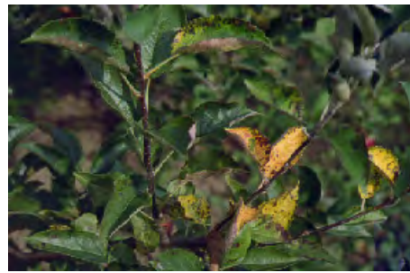
Figure 2: Small necrotic leaf lesions resulting from high-rate (>2%) applications of traditional summer oils take place under poor drying conditions.

conventional miticides, and as oil refining techniques improved by removing more impurities, products such as SACOA's SUMMER® and BIOPEST® were developed, resulting in less damage to green tissue.